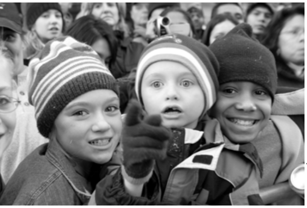
In 2009, we need your help in creating lifetime memories for the millions of viewers!

So, be a sponsor, a benefactor, a supporter and a patron of this wonderful Chicago-based tradition. And through the course of your support, receive unparalleled event exposure that includes television, radio, print and internet. You can call any of our staff members to find out more about becoming a partner today.