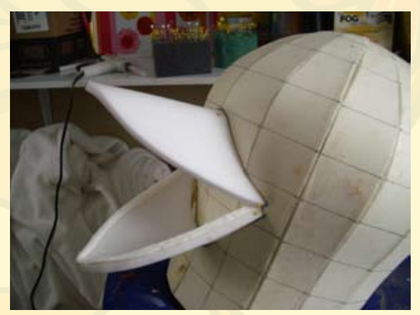
The head starts to take shape.

Switzerland, Jasper the Bear for Jasper Alberta, Captain Crime Stopper for Crime Stoppers, and Rocky for Western Illinois University. I've made many more that have turned out amazing!