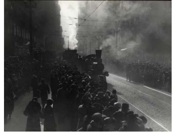
In 1934, a steam engine train pulled the first holiday parade into the city to the excitement of the onlooking Chicagoans.

In 1934, our country was nearing the end of the Great Depression. A group of local businessmen thought that a Christmas parade on State Street would be the perfect way to lift the spirits of Chicagoans and an effective way to increase retail activity during the holiday season. They were right on both counts,