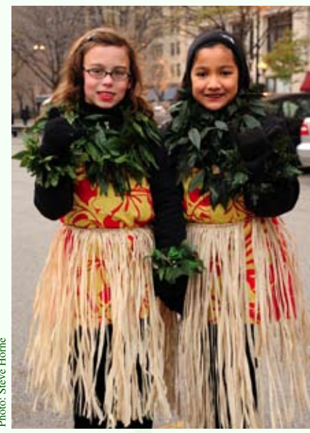
The younger Barefoot Hawaiians wave to the camera at the 2008 parade.

BH: We have been a part of the parade for 10 years now. We were first asked to participate by committee members who saw our performance and thought it would be a unique addition to the lineup.