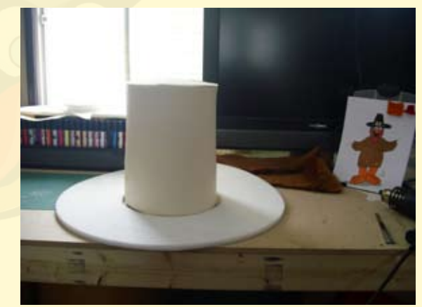
Everything starts with a simple sketch.

TT: How long have you been making mascots and what are some of the characters that you have brought to life?KD: Over 15 years. Some of the really fun ones were Torchie for the International Olympic committee in