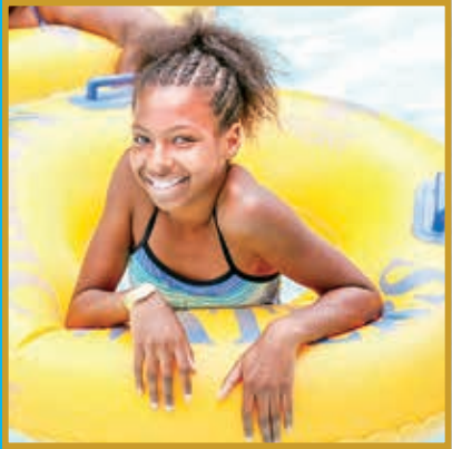
Mystic Waters on page 14