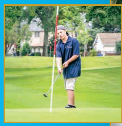
Lake Park Golf on page 28