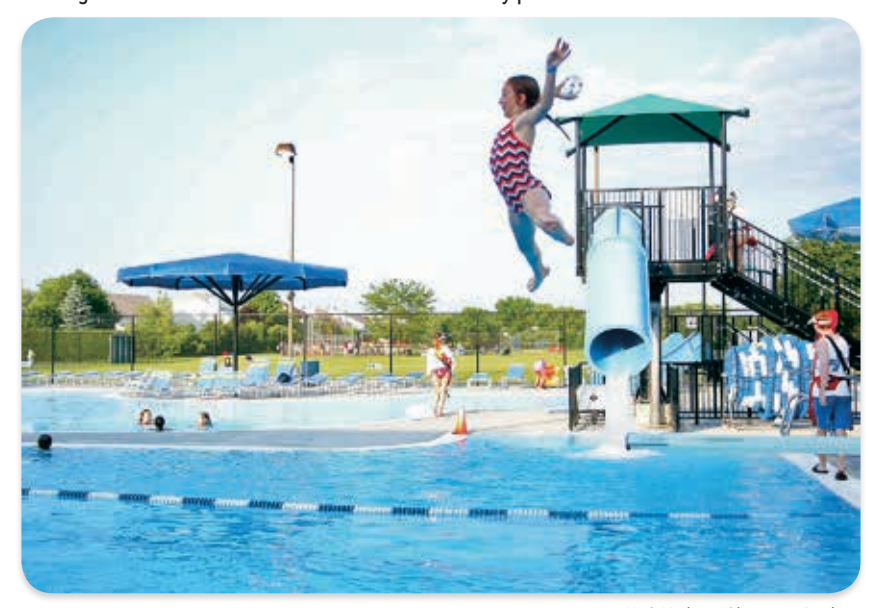
H2O Night at Chippewa Pool

It is not uncommon for swimmers to repeat a level for several sessions. Registration for all swim classes ends on the Friday prior to each session's START date.