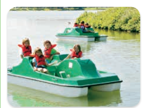
Paddle boating on Lake Opeka