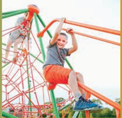
Park It! on page 5